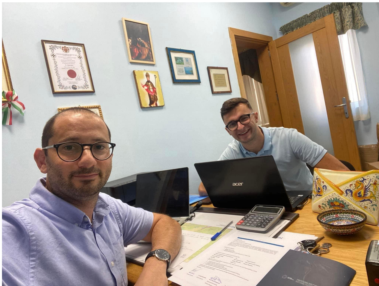
Photo: Certificate of the Confraternity in the Office of the Mayor in Nadur, Gozo. Malta,