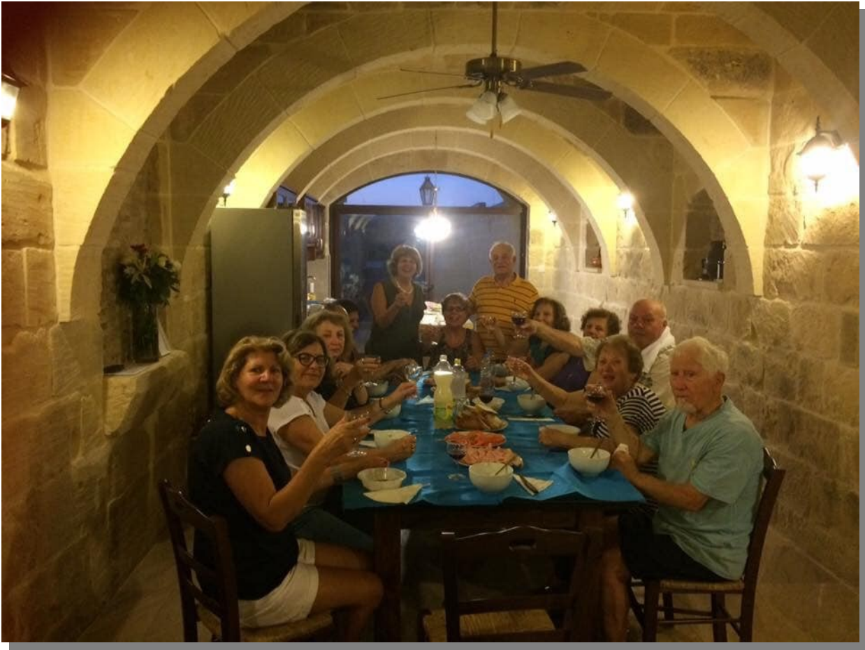
Having dinner in a farmhouse in Gozo Malta

Beautiful memories of the trip in Malta during the knights convention in June 2017.