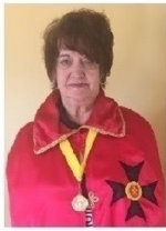
Dame Eliza Pellicano Grand Dame of Justice