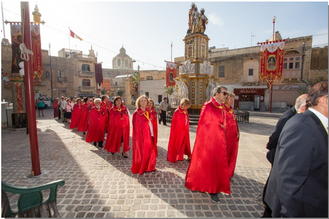
Procession with the bishop and the clergy from the Church of the Sacred Heart to the Basilica of St. Peter and St. Paul 28 June 2017