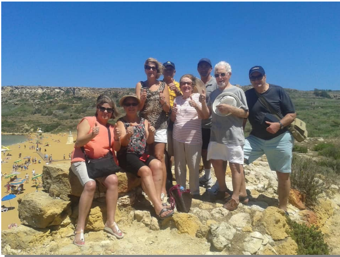
Relaxing at Ramla Bay in Nadur Gozo.