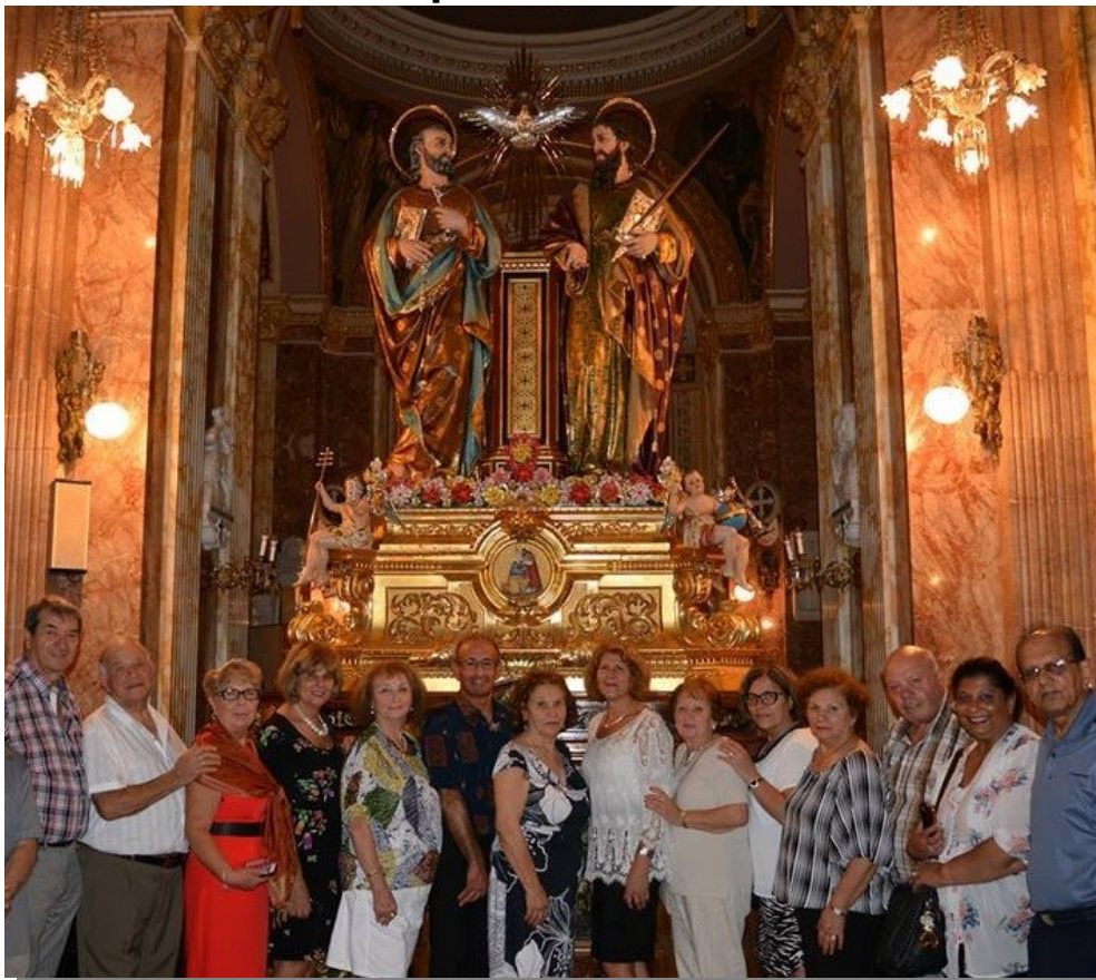
Group photo in the Basilica of St. Peter and St. Paul in front of the statue 29 June 2017.