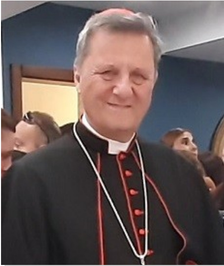
His Eminence Cardinal Mario Grech

In the Synod on Synodality, the entire Church has been called to discern how the Spirit is moving through and with the Body of Christ - inside and outside the Church - so that we may continue to fulfill our mission to evangelize in the world.