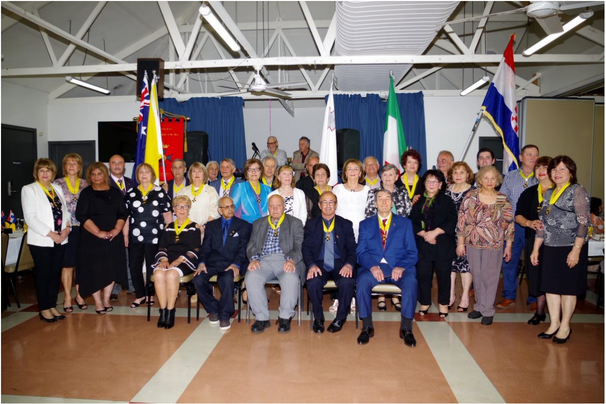
Knights and dames who attended the function