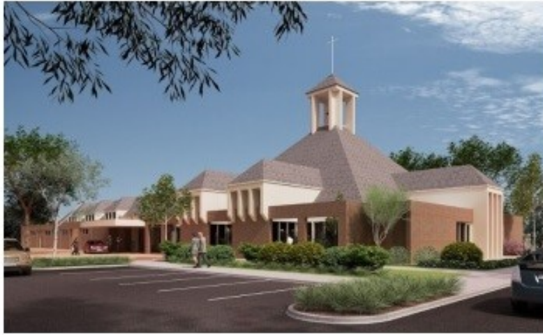
Church of St. Catherine of Siena in Melton West.