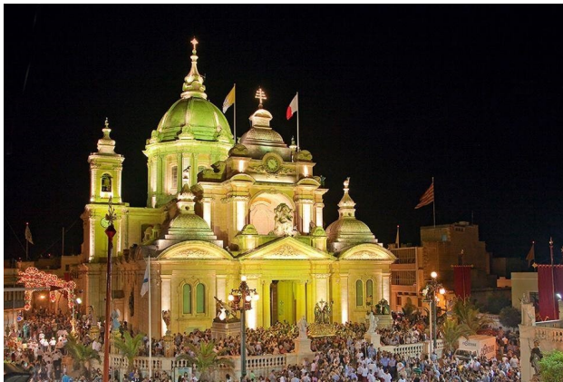
Basilica of St. Peter and Paul in Nadur. Gozo.

It will be a great occasion to meet with as many knights and dames during the festivities of our Patron Saints Peter and Paul.