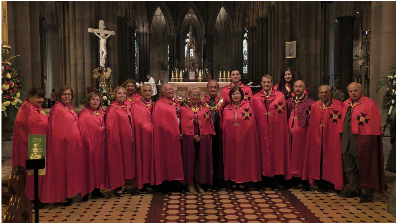
Group photo after the Mass at St. Patrick's Cathedral