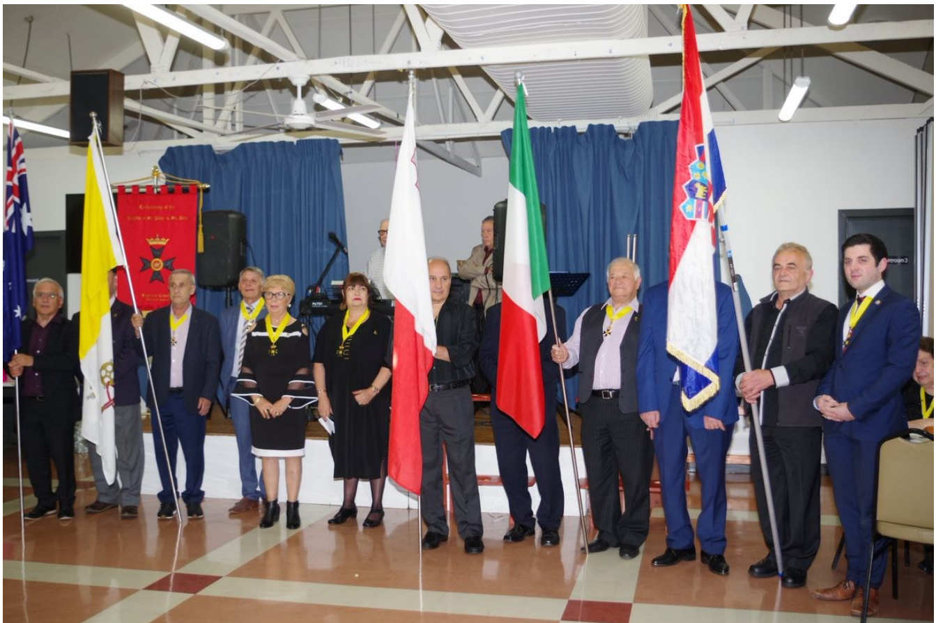
Flags that represented Australia, the Vatican, Maltese, Italian, Croatian, German and Pakistan.