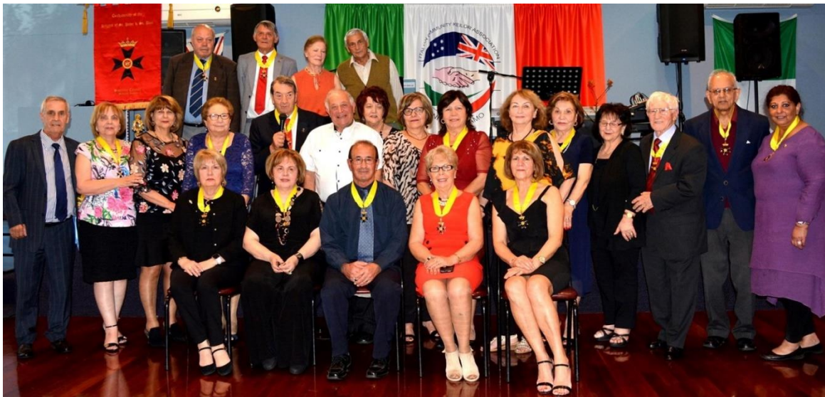
Group photo of the knights and Dames that attended the Fund Raising event.

The Grand Chapter of Melbourne organised a lunch last Sunday 13 October, 2019 to raise money for charity. The Lunch was held at the Italian Community Club of East Keilor here in Melbourne. Thanks to the hard working team of knights and dames, most of the supplies was donated, including most of the work. Thanks to ICKA Club for providing the assistance for the event to be very successful. At the end of the event, $8,000 was raised to the Royal Women's Hospital - Newborn Intensive Care Unit