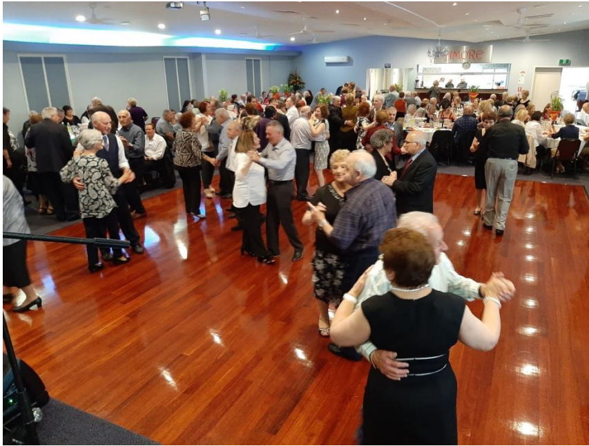
Another successful event.