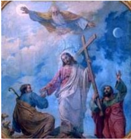
Painting of the first missionaries of Christ, St. Peter and Paul at the Basilica of Nadur, in Gozo, Malta.

I must emphasize that the role of a knight or a dame is to imitate St. Peter and St. Paul in their mission given by the Lord Jesus himself. We can imitate St. Peter and Paul by helping missionaries to reach out and teach the word of God. God bless you in St. Peter and Paul.