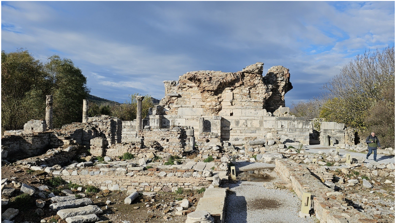
Ruins of the former St. John's Basilica in Ephesus.

Theotokos, (Greek: “ God-Bearer ”), in Eastern Orthodoxy, the designation of the Virgin Mary as mother of God.