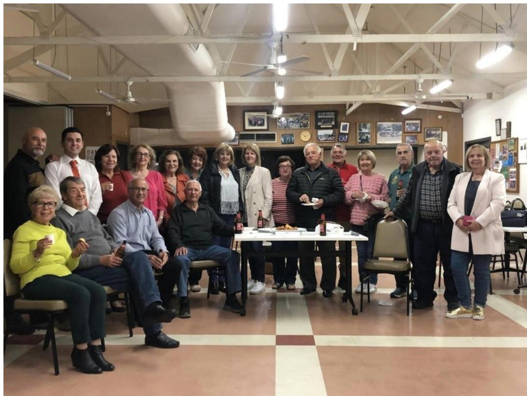
Photo: The members having a drink and a chat after the meeting.

The meeting concluded with the Supreme Council thanking everyone who is supporting the Confraternity of the Knights of St. Peter & St. Paul in any way and we look forward to continuing our work in 2024.