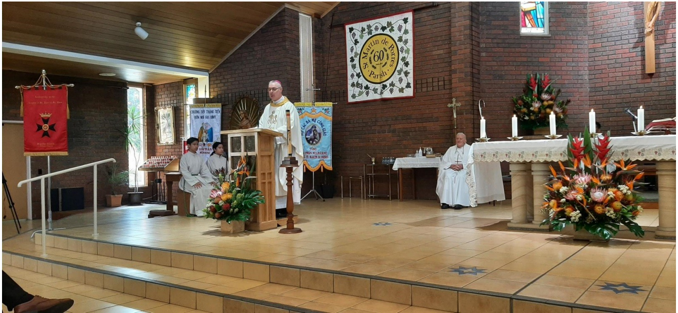
Photo: The Most Rev. Archbishop Peter Comensoli of Melbourne presided on the celebration.