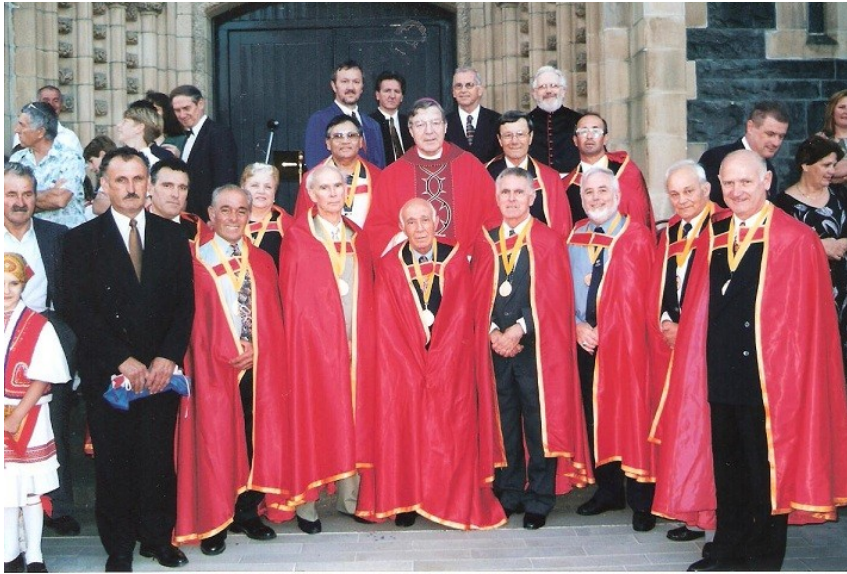
Group photo with then Archbishop Most Rev. George Pell of Melbourne 10 February, 2001.