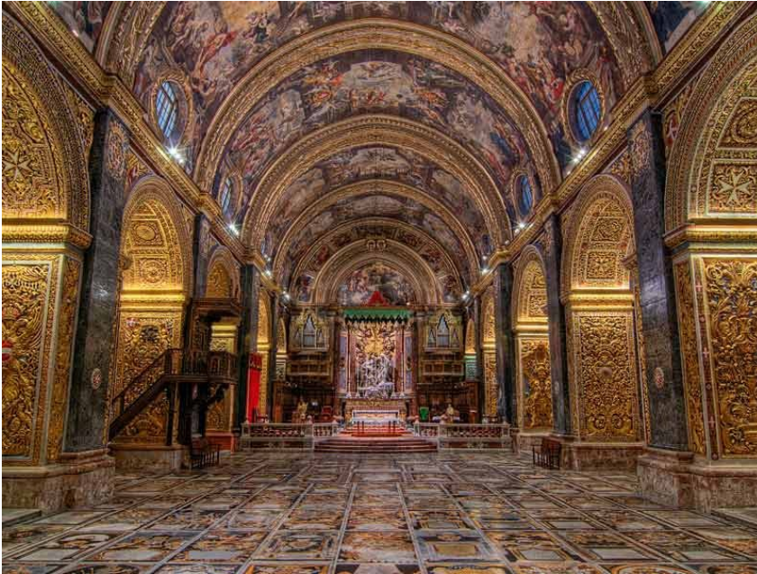
St. John's Co-Cathedral in Valletta built by the Knights of Malta between 1573 and 1578.