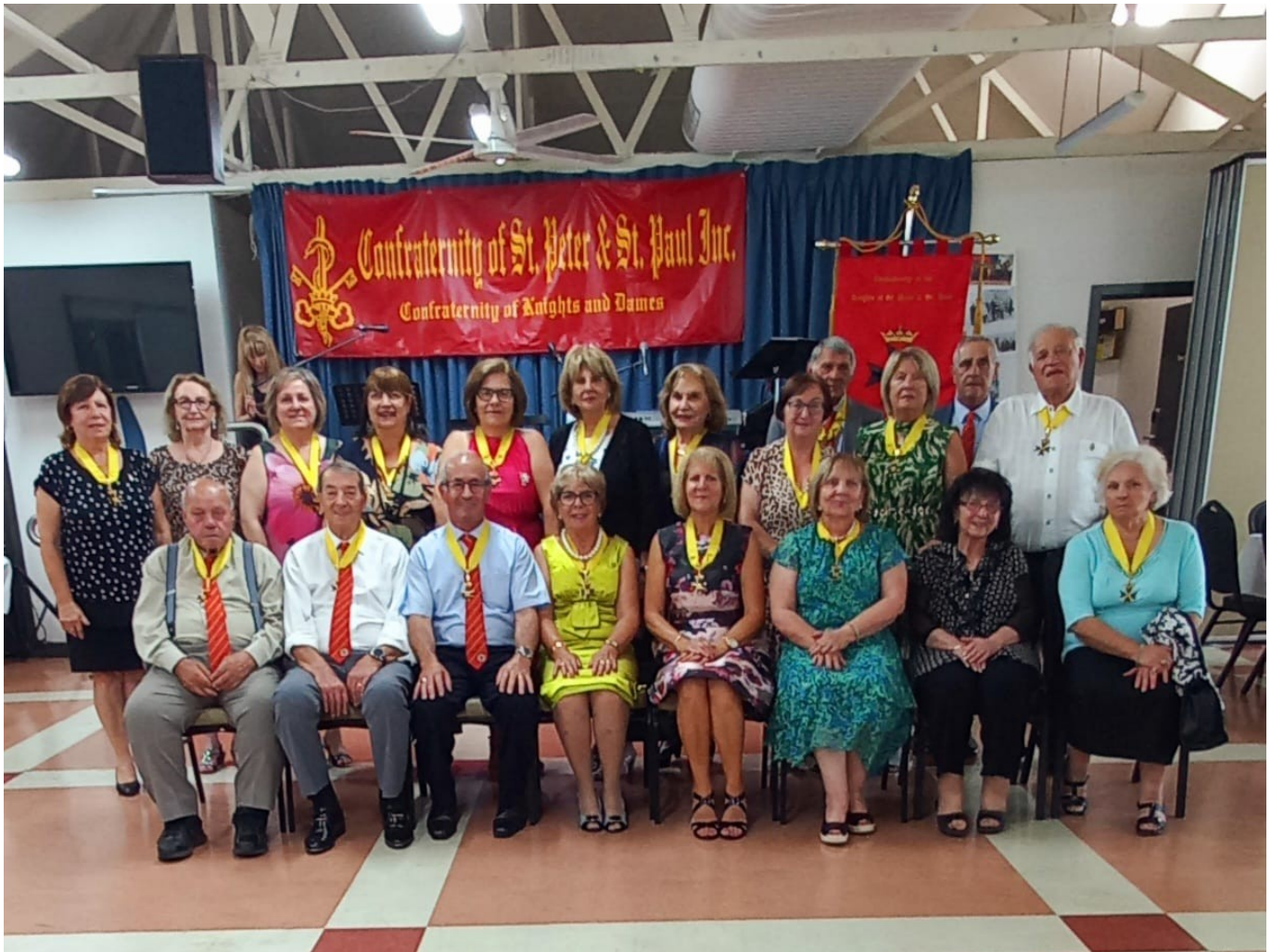
Group photo of the members who attended the event.