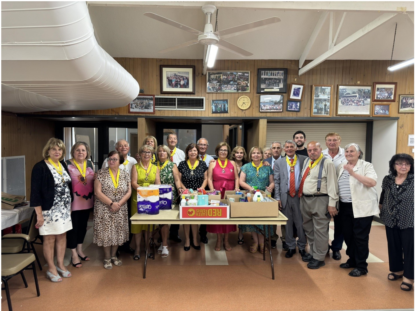
Donation of food and household goods presented to the Croatian Catholic Church for the needy. for the needy