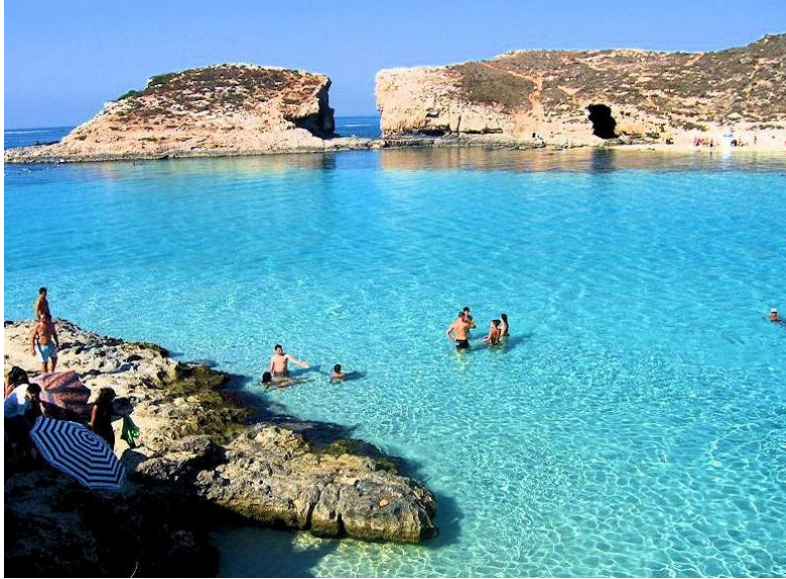
Blue Lagoon Comino.