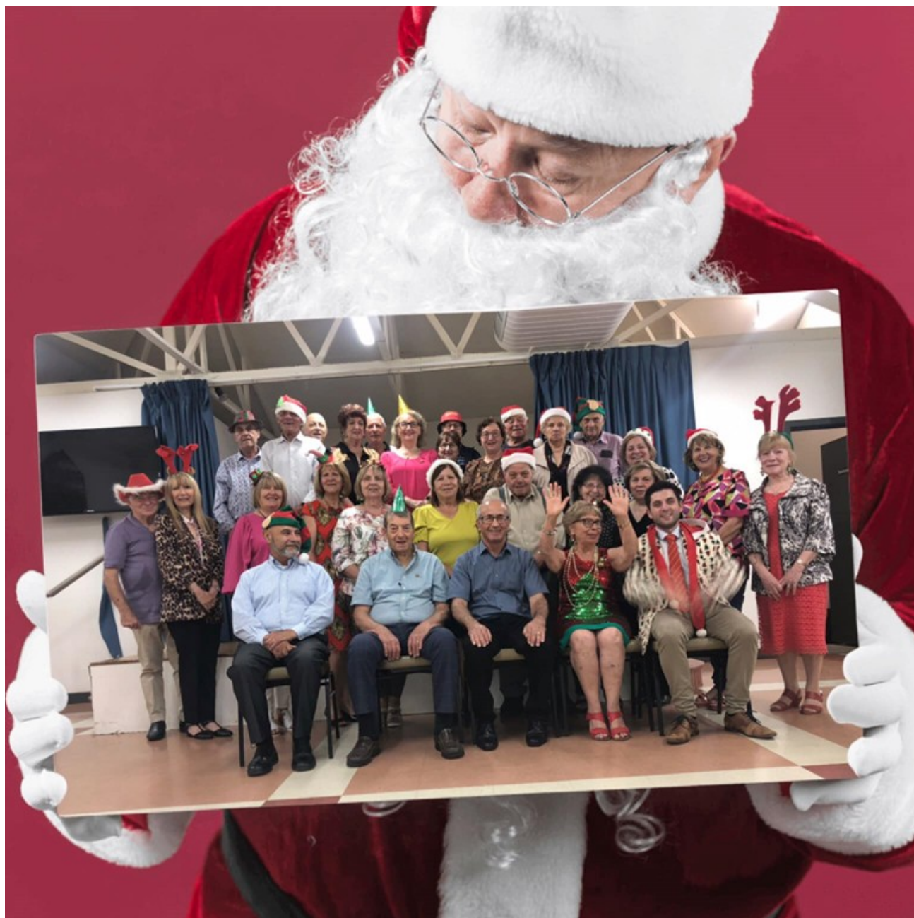
Members and volunteers of the Confraternity in Melbourne.

Frohe Weihnachten (German ) Sretan Božić (Croatian) Feliz Navidad (Spanish)