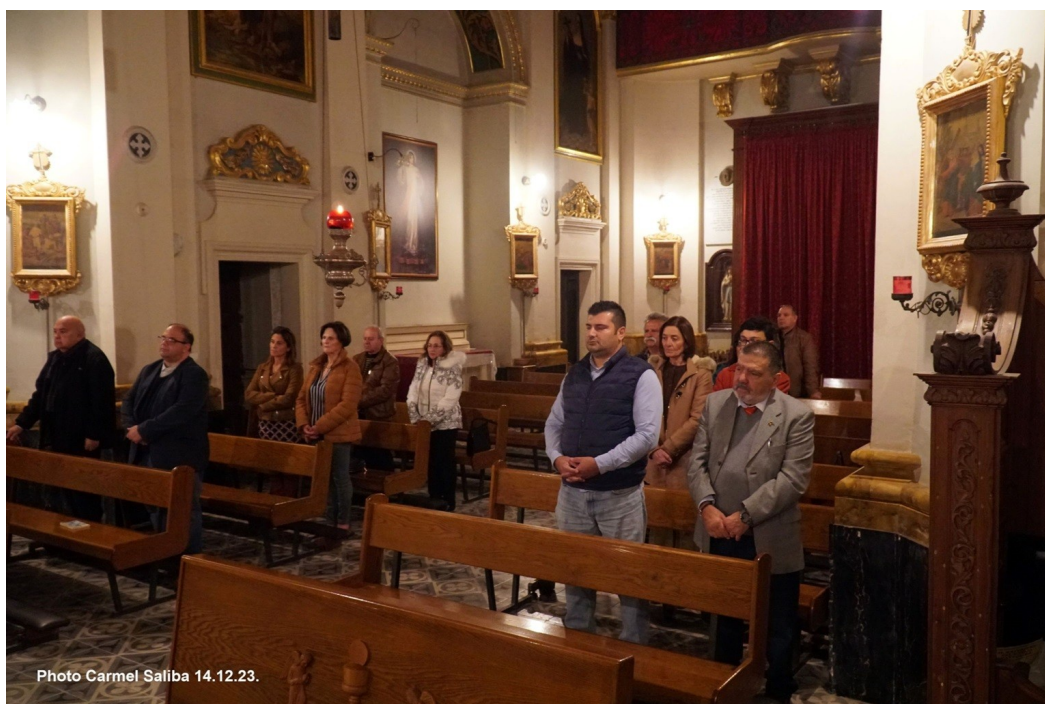
Knights and dames of the Confraternity attended a Christmas Mass at the church of the Sacred Heart in Nadur, Gozo. Malta.