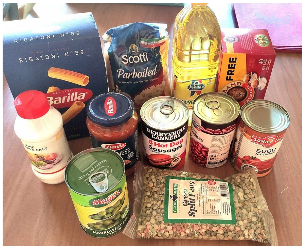
Hampers for the needy