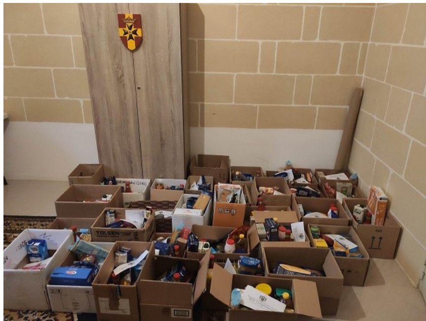
Goods collected at the Basilica of St. Peter and St. Paul and the Town Hall of Nadur:

The Chapter of Malta wishes everyone a Blessed Christmas and a Happy New Year 2023.