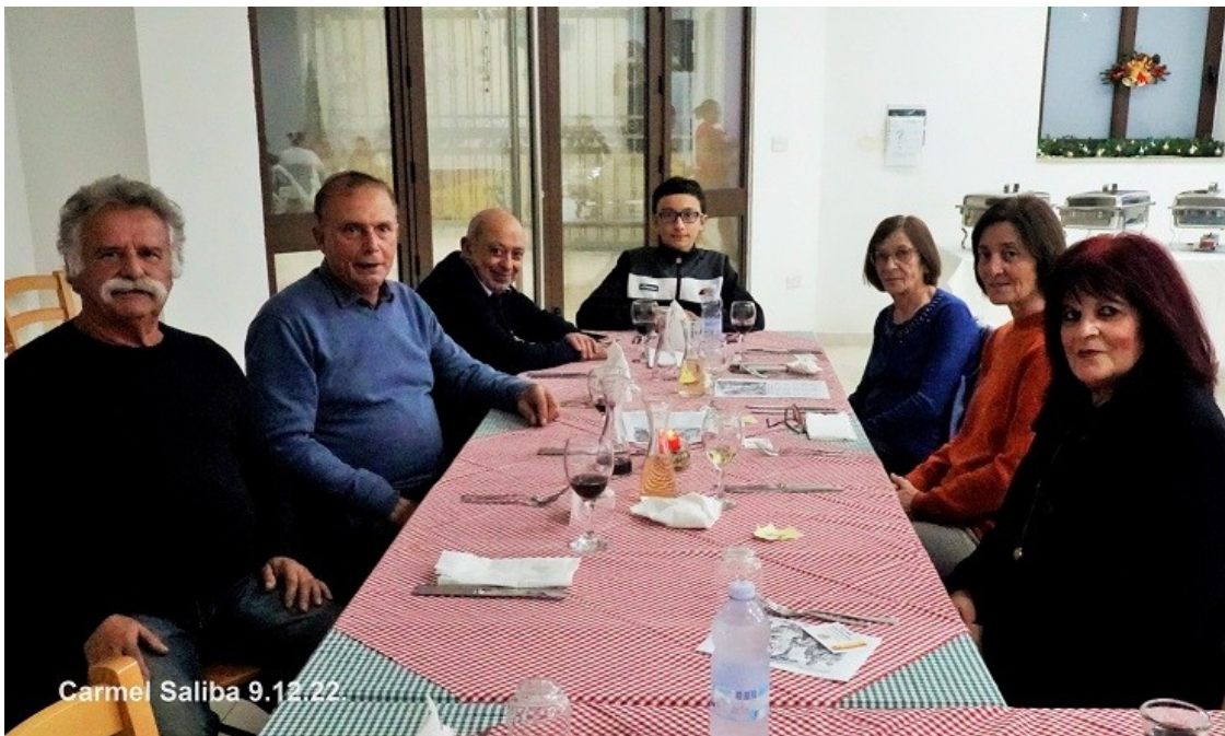
Charity Christmas Dinner