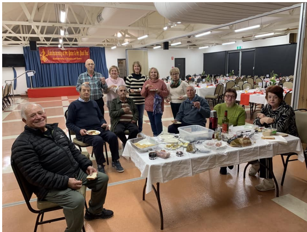
Photo on the left: Knights and Dames who helped setting up the hall.