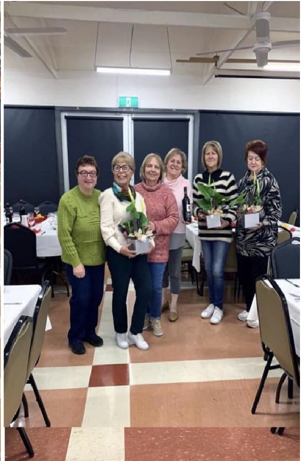
Hard working ladies preparing the hall for the Luncheon.