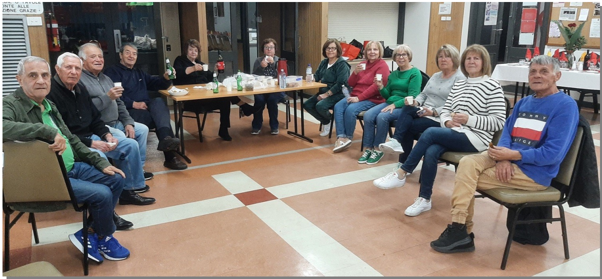
The helpers who set up the hall, enjoy a drink after the work is done.