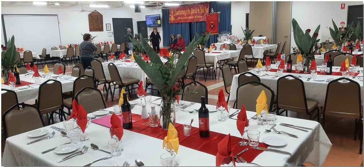
The hall is set for the fund-raising luncheon