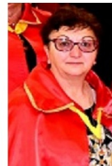
Dame Franca Pellone Grand Dame of Justice