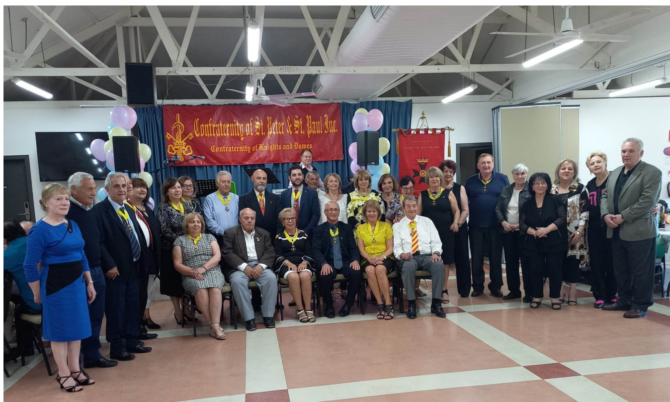
Group photo: Knights and Dames of the Confraternity at the fundraising Luncheon.