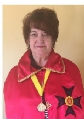
Dame Eliza Pellicano Grand Dame of Justice