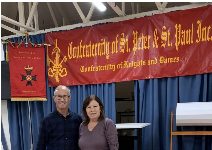
There is a very old and famous saying, "behind every successful man, there stands a woman"